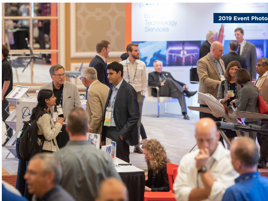
2019 Event Photo

Sponsor a highly visible session within AIAA AVIATION Forum. As a sponsor, you will receive recognition in all content marketing related to the session and verbal recognition by the moderator.