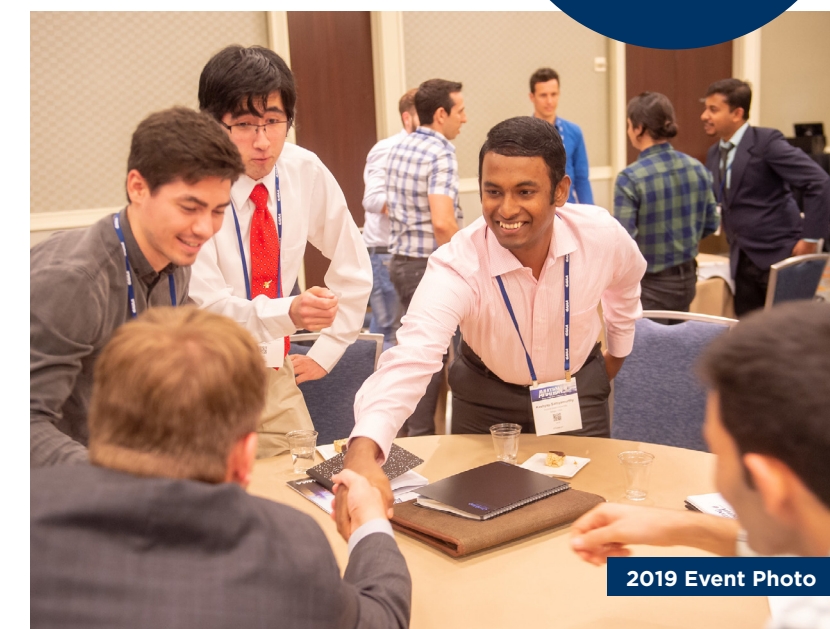
2019 Event Photo

AIAA'S SOCIAL MEDIA CHANNELS HAVE AMASSED MORE THAN 109,000 FOLLOWERS