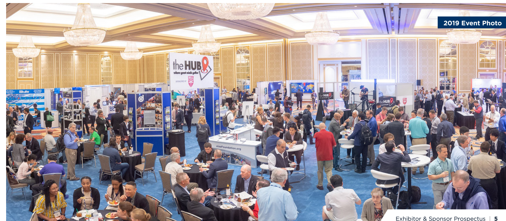
2019 Event Photo