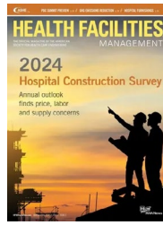
March/April 2024 + Bonus Distribution